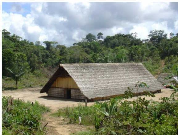
People in the Amazon Basin live in houses called 'maloca' which have a slanting roof