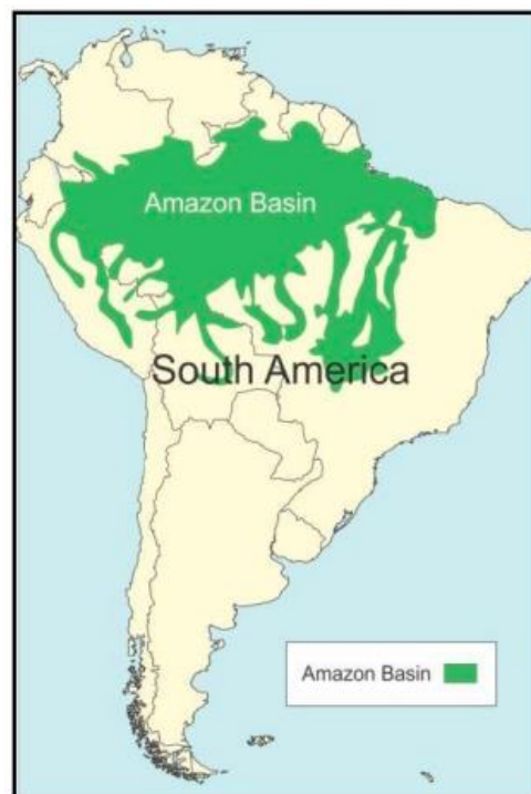
The Amazon River Basin

A basin is a portion of land which is drained by a river and its tributaries. The Amazon Basin is drained by the River Amazon- the second longest river in the world. The river basin drain parts of Brazil, Peru, Ecuador, Bolivia, Columbia and a small portion of Venezuela into the Atlantic Ocean.