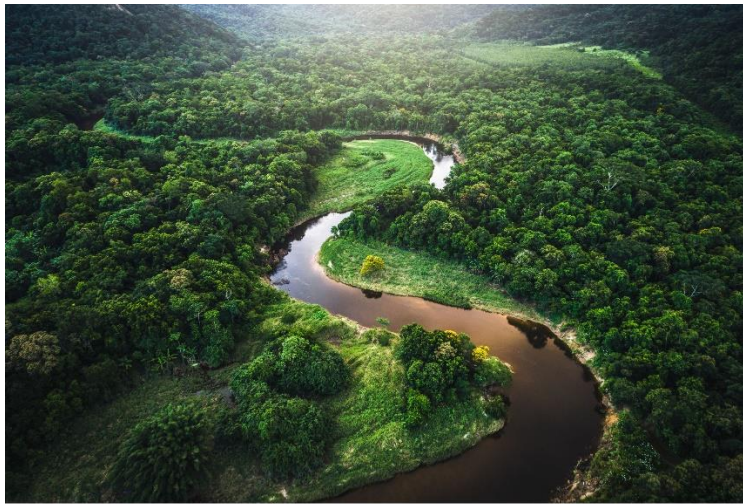
In amazon rainforest, many species of animals, birds and insects are found.