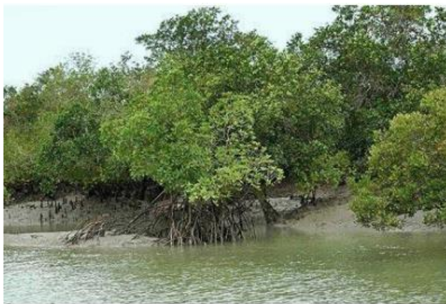
The sundari trees are commonly found in the Sunderbans.