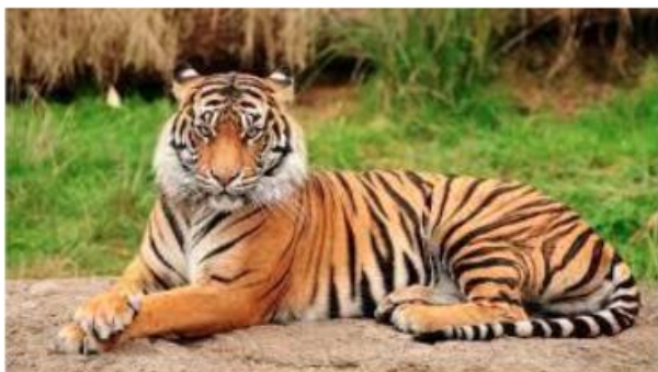
The Royal Tiger of Bengal