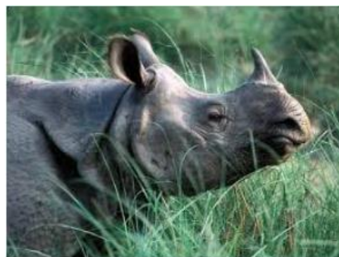
One horned rhinoceros