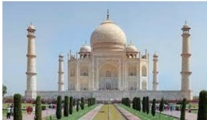
The Taj Mahal is visited by many people from across the country and abroad